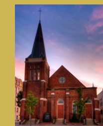
"Your Point of Contact for the Kingdom of God!"